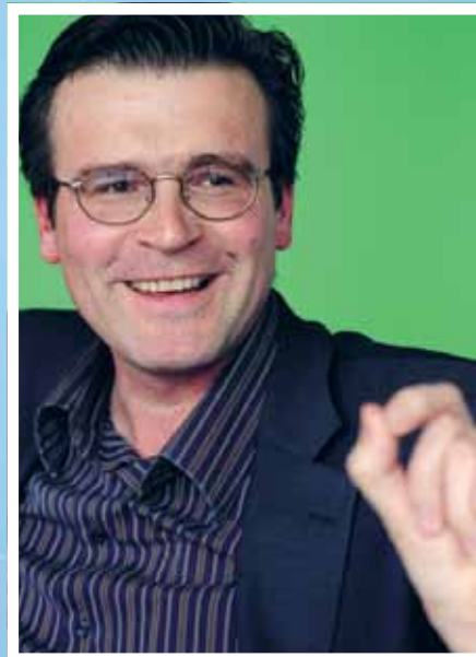
Zoran Thaler, new rapporteur of the EP for the country

Slovene MEP Zoran Thaler (member of the group of social democrats) will be the new rapporteur for the country in the European Parliament over the next five years. Mr Thaler, also a former Slovene foreign minister, is succeeding to the outgoing Dutch MEP Erik Meijer.