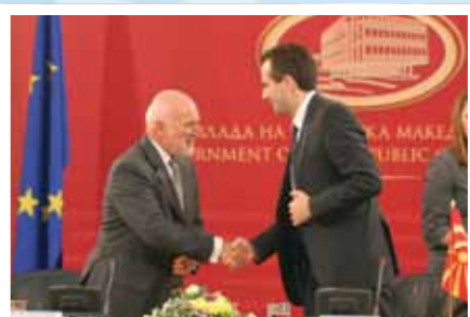
Ambassador Erwan Fouéré and Deputy Prime Minister Vasko Naumovski sign the Financing Agreement

On 14 September 2009, EU Special Representative and Head of the Delegation of the European Commission, Erwan Fouéré, and the Deputy Prime Minister in charge of European Affairs, Vasko Naumovski, signed the Financing Agreement of the Regional Development component of the pre-accession assistance (IPA). The Strategy for assistance under Component III, in line with the priorities set out in the Accession Partnership