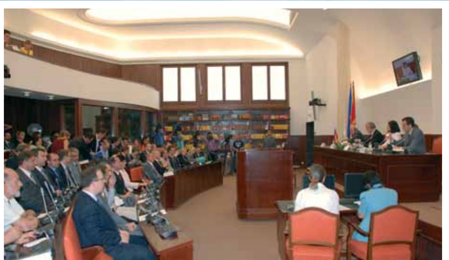
Olli Rehn addresses the National Council for European Integration

Answering to questions from the audience, Commissioner Rehn encouraged the authorities to keep up the momentum of reforms and meet the outstanding benchmarks before the publication of the Commission's Progress Report on 14 October.