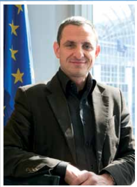
Dr Jorgo Chatzimarkakis, new co-chair person (JPC)

Dr Jorgo Chatzimarkakis was first elected MEP for the German Liberal Party in 2004 and was a member of the Committee on Industry, Research and Energy and of the Committee on Budgetary Control (in the latter he is coordinator for the liberal ALDE-group). In the 6th term of the European Parliament, he was Rapporteur for the Competitiveness and Innovation Framework Programme. Chatzimarkakis studied agriculture and political sciences in Bonn and Oxford; holds a PhD in political science, obtained from the University of Bonn in 2000.